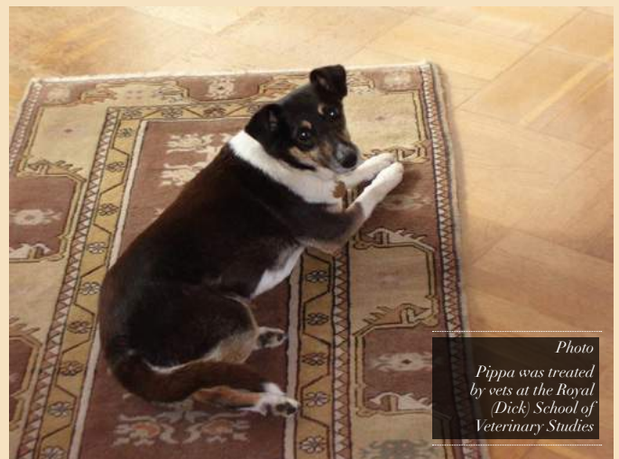
Photo Pippa was treated by vets at the Royal (Dick) School of Veterinary Studies