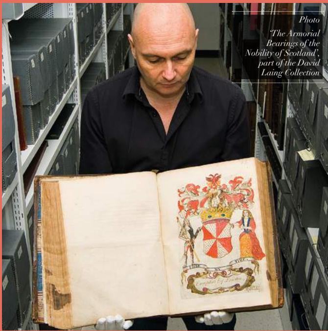
Photo 'The Armorial Bearings of the Nobility of Scotland', part of the David Laing Collection