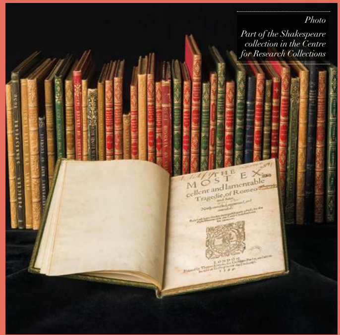
Photo Part of the Shakespeare collection in the Centre for Research Collections