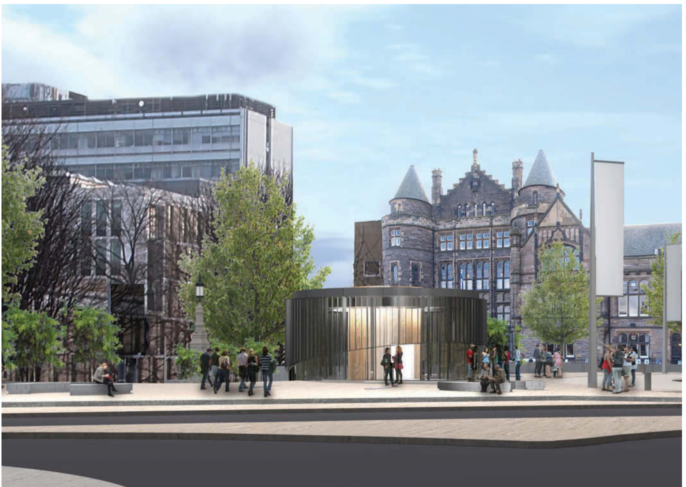
Artist's impression looking towards Bristo Square and Teviot Row House, showing the planned new entrance to McEwan Hall