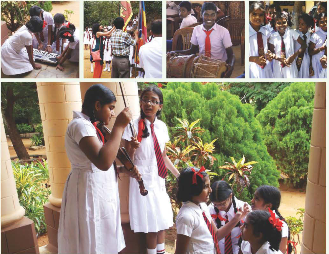
2014 workshops in Jaffna, Katuwana Hambantota and Killinochchi

abstract in that it is not possible to express specific meanings through musical sound. This is the case with most artistic modes of expression, and I have found that it is this defining nature of the musical communicative mode that underlies the peculiar and special healing property of musical expression, especially when involving the composition and performance of one's own music."